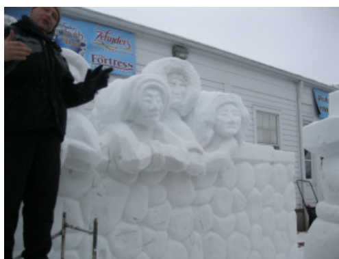
Select 6th grade students and members of the Junior National Honor Society attended the Frankenmuth Snowfest on January 27. Students braved the cold weather and were able to see snow and ice carvings of artists from all over the world.